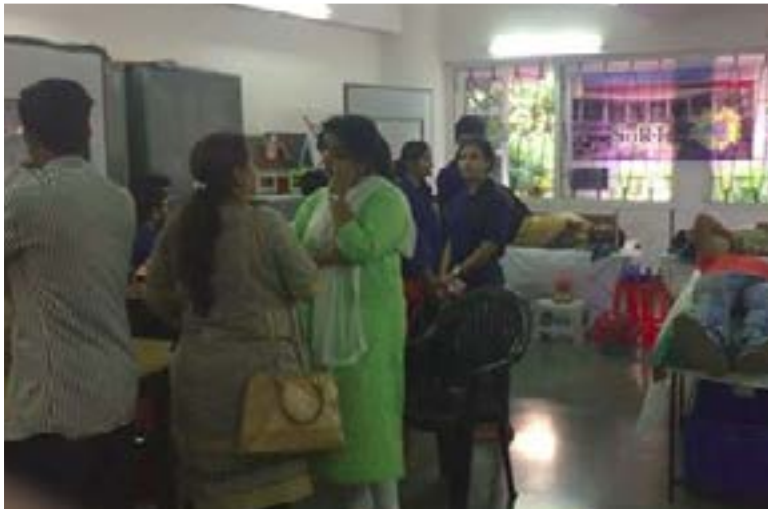
Blood Donation Camp 2017