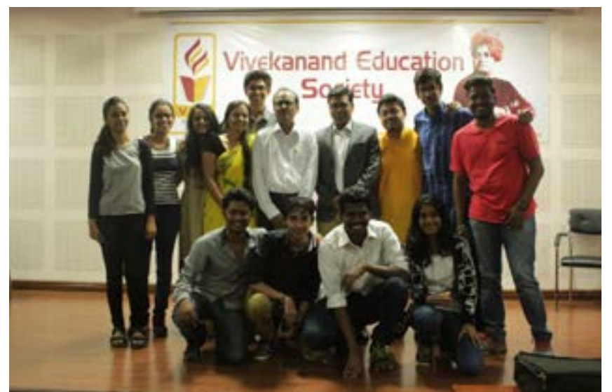
Winning team D4A