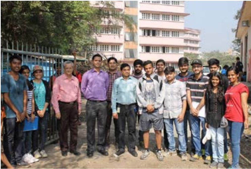
Outdoor Sphurti Inauguration

Congratulations to all the winners and runner ups!