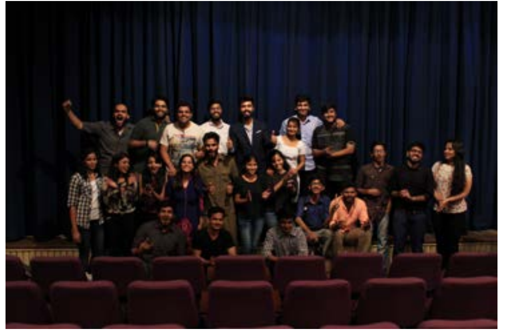
The VESIT Drama Team

The college drama team recently bagged the first prize for their inspiring performance at Manzar '17, the cultural fest organized by the Institute of Chemical Technology, Mumbai. Manzar is the annual cultural fest of ICT, Mumbai, which was held on 4 February 2017.