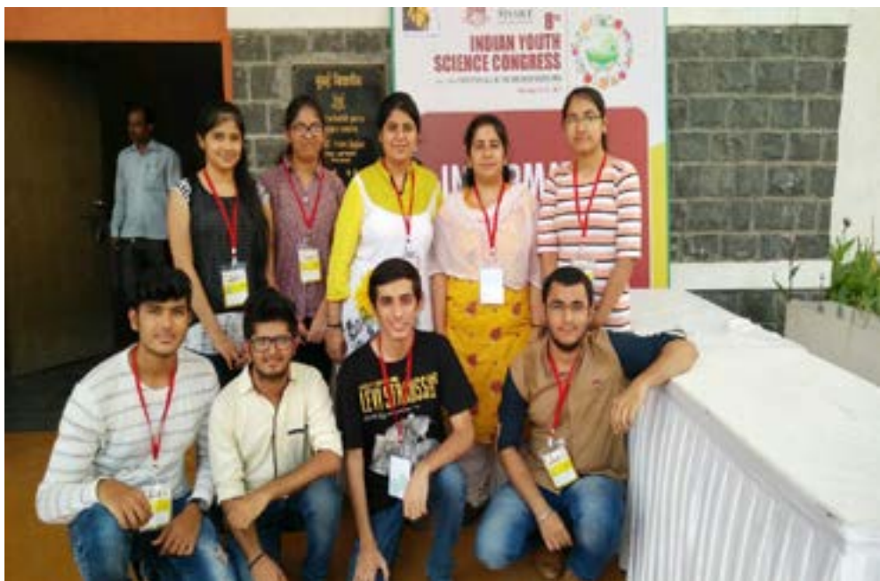
Students at 8th Youth Indian Science Congress