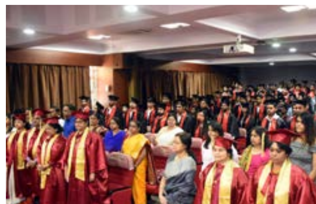
Degree Distribution Ceremony 2017

The students receiving their degrees had to first, register themselves at the desks run by BE student volunteers and then, pick up their robes and later head towards their respective contingent as they moved in a procession from the second entrance of the building, around the Swami Vivekananda statue and into the auditorium.