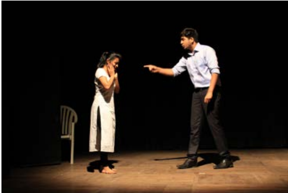
The VESIT Drama Team