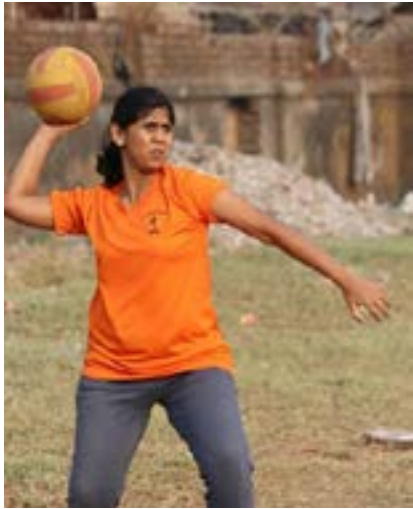
Player in action during match