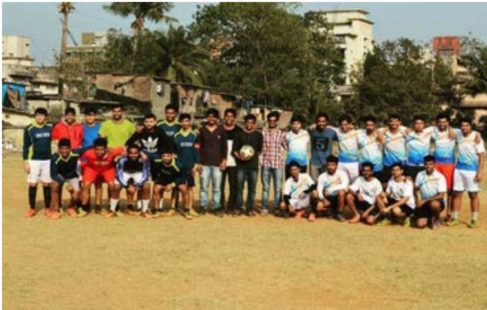
D18 Won Sphurti Football Final